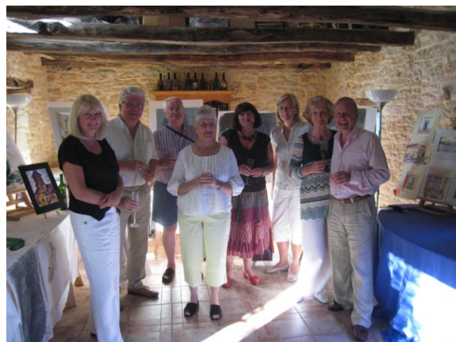
The week ends with a mini exhibition and a celebratory toast